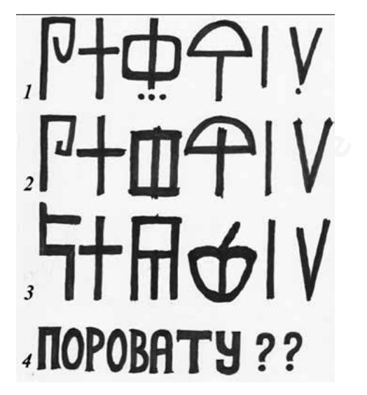
Figure 4: Similarities between the characters of the: 1 Parvomai inscription 2 Danubian style and Balkan style scripts, 3 Linear A and Linear B scripts, 4 sound values of the characters of the Parvomai inscription based on the sound values of the Linear A and Linear B scripts, the sound values of the last two characters remain unknown.

BC. The similarities between Linear A and Linear B characters (Evans, 1961; Chadwick, 1995) with those of the cultures of Gradeshnitsa, Valchi Dol, Vincha, Magura cave and Tartaria are probably due to influences of these South Balkan or Danubian cultures on the Aegean and Mediterranean cultures. This hypothesis is particularly important because it permit to give sound values to the characters in the inscription of Parvomai (Figure 4).