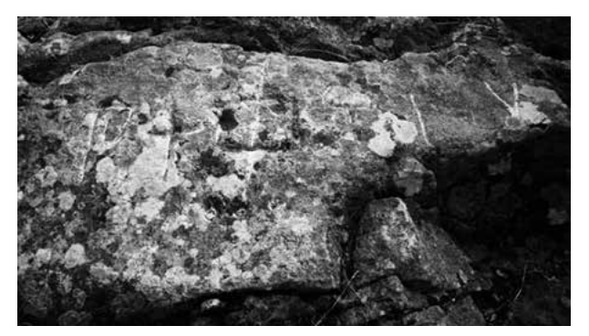
Figure 1: Rock hosting the inscription of Parvomai (Kmeta.bg., 2016).

The rock hosting the inscription of Parvomai is shown in Figure 1 and the layout of the inscription is shown in Figure 2.